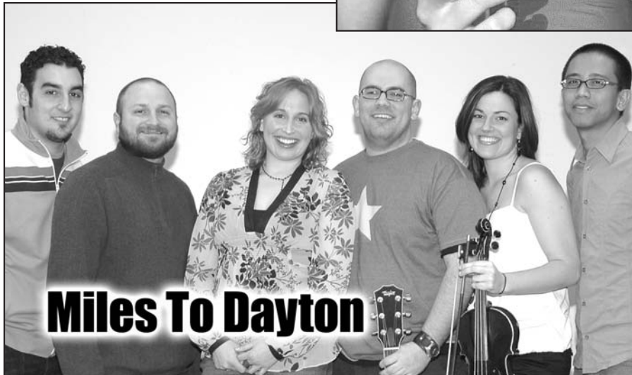
Miles To Dayton